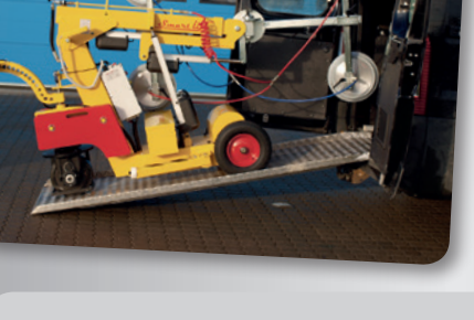
The Smartlift is easily transported in a van or on a trailer