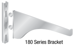
180 Series Bracket