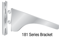
181 Series Bracket